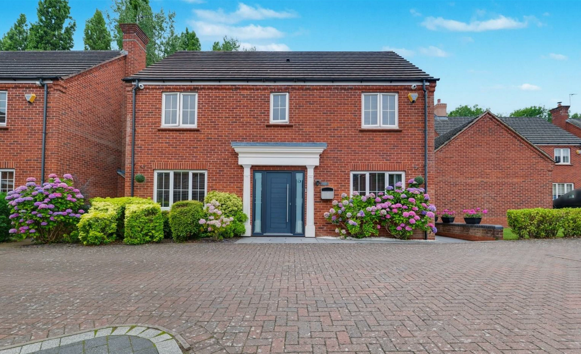
Bronze View, Coventry, CV4 8HR